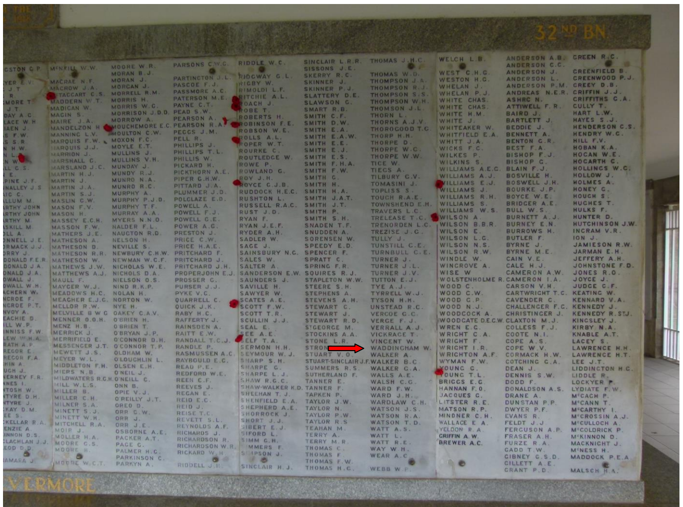
28th Battalion Panel