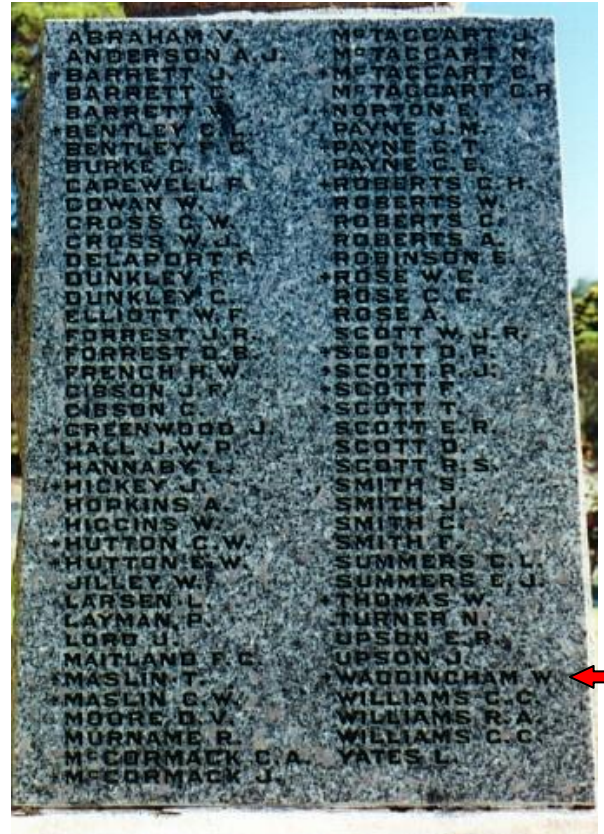
Capel War Memorial